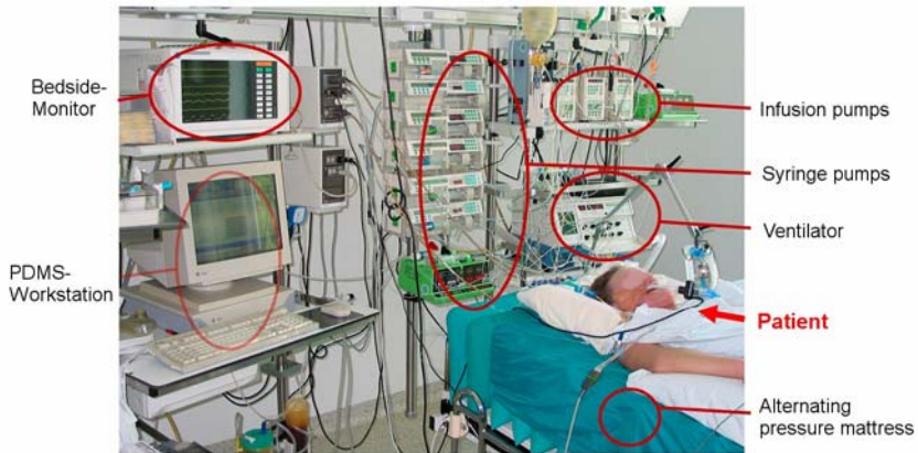
Fig. 1. Patient embedded between technical equipment on a modern ICU

as for conscious patients in general wards and allow health personnel to quickly diagnose and react on critical patient conditions. The interaction with medical devices is often difficult and cannot be effective without a huge amount of previous knowledge. Furthermore the medical devices from different manufacturers often vary in their operating philosophy. Patient monitors for example often have different controls/keys with a different layout. Thus nurses often have to adapt to a different handling while going from one patient to another or interacting with various devices (e.g. ventilator, patient monitor and syringe pump) at one patient. Obradovich and Woods [2] and Wears and Cook [3] show that these devices often suffer from bad usability. This deficiency is of particular importance because the workload of many users in the medical domain does not give them enough time to carry out in-depth examinations of these technical devices [4]. Health personnel often refuse to change visual settings of devices because they fear that they could end up with an even worse layout and not being able to change it back.