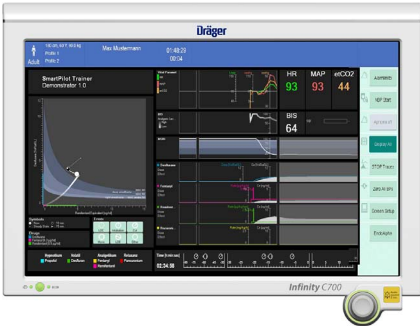
Fig. 4. “SmartPilot” Prototype state of December 2007

In the next phase a functional prototype was developed and formal usability studies have been conducted. In the end, a display evolved which includes the most important vital signs as deviation from a norm, the combined effect of analgesic and hypnotic drugs as a graph as well as an index which was deliberately developed for this display to quantify the anaesthetic effect (Fig. 4). Furthermore, the concentration of each drug at effect site is displayed in relation to the according dosage. In relating the vital signs as an indicator for the current patient state with the calculated drug concentrations, the anaesthesiologist is able to relate the drug reaction of the individual to the norm. All information is displayed on a shared time scale to simplify the contextual interpretation. On this time scale additionally events like “skin incision” can be marked. As SmartPilot combines measured variables with model based calculations, it is crucial to visually separate the two. Therefore all vital signs are in a separate box, all calculated drug concentrations, and the indices BIS and NSRI also have a single box each.