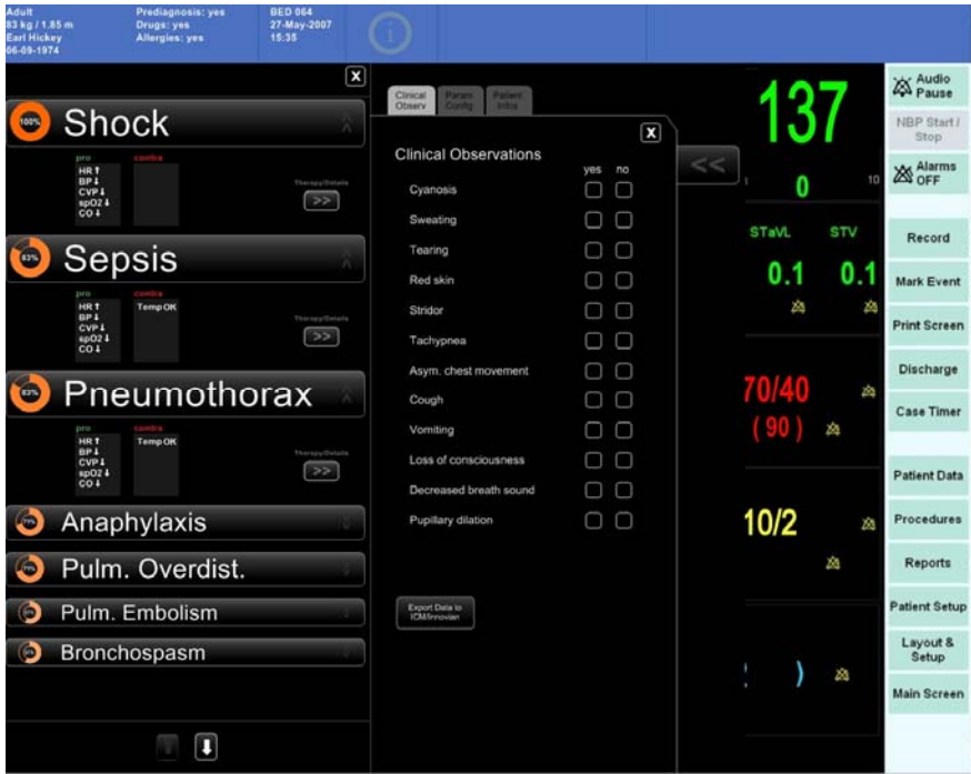
Fig. 6. Diagnosis Display with the possibility to add clinical observations

making process. They would like to see lots of information and diagnosis on the display. The majority of the nurses however are primarily interested in symptoms, not diagnoses, because these symptoms trigger the nurses' treatment activities, without the prior involvement of a physician. E.g. one nurse stated: "diagnoses are not important for me".