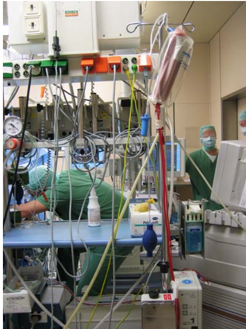
Fig. 2. Anaesthesia workplace in an OR

First observations in ORs showed that anaesthesiologists do not want an additional device to be monitored at their workplace. Anaesthesiologists often work in crowded