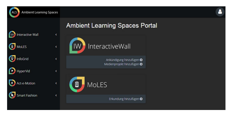
Figure 9. ALS Portal for management of ALS applications and content.