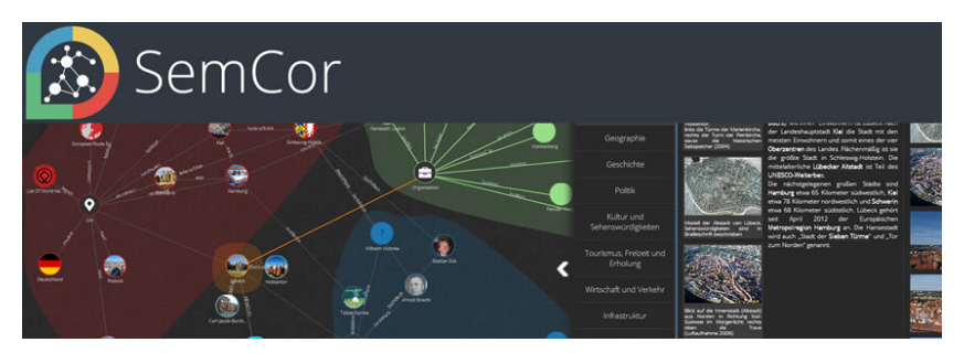
Figure 6. SemCor interacting with knowledge entities and relations

SemCor (Semantic Correlation) is another application available on the IW. Students explore information elements along with semantic relationships provided by the global DBpedia database. Ontologies are leading to knowledge chunks related to each other in a semantic mesh (Fig. 6). While being used, the system is constantly searching the World Wide Web for new entities related to the already displayed and selected ones. Different algorithms to calculate similarities and differences of such entities help to choose from a large number of candidates found to be displayed. SemCor gives insights to very large information repositories and supports associative learning based on serendipity as well as student's own curiosity (Herczeg et al. 2020b).