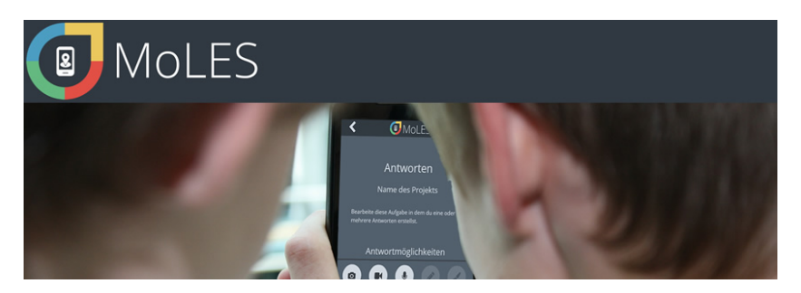
Figure 7. MoLES, a mobile task-oriented system.

MoLES is a web application for smartphones and tablets to support task-oriented teaching mainly outside school for example in urban space, natural habitats or museums (Fig. 7). Teachers or more advanced students can define structured tasks to be solved within project-oriented teaching (Winkler et al. 2009). The students will work on tasks like challenges, which they have to solve mainly outside school. While completing the tasks they create and collect media entities captured with their mobiles. These media will automatically be uploaded into the NEMO system and become available for further use as a documentation of results in a project-centered media gallery (Herczeg et al. 2020a).