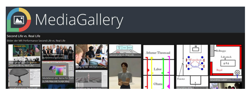
Figure 4. A sample media collection in the MediaGallery.

The MediaGallery is an application running on the IW. As the IW is providing public interactive displays, the MediaGallery enables learners to explore personal, group-based or public media collections about their learning topics (Fig. 4). Each collection consists of a set of images, podcasts, videos, documents or 3D objects that are either manually combined or selected by semantical correlations and search. When multiple media galleries are available, the IW has an area to place randomly selected dynamic previews of public media collections on the IW. Media collections display, connect and separate content. They represent ownership and topical common ground.