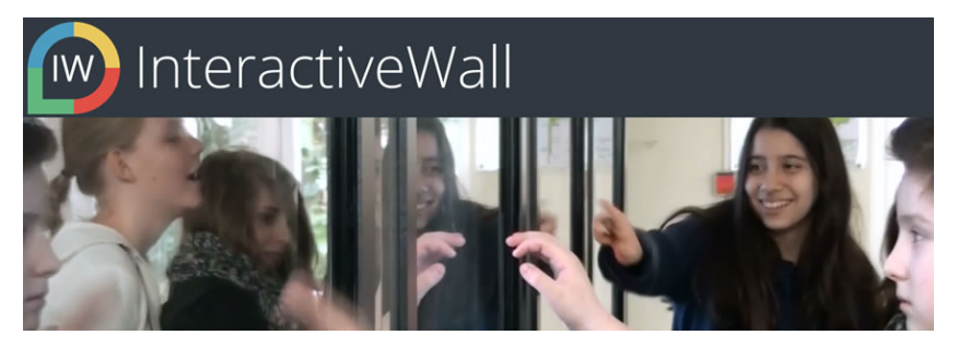
Figure 3 . The Interactive Wall (IW) as a social access point to ALS.

As a central integrative element, built as a stationary frontend for class-rooms or school foyers, we implemented a system called the Interactive Wall (IW) . The IW is a social entry and access point for teachers and learners and supports cooperative learning (Winkler et al. 2017). It consists of an arbitrary number of large interactive displays that can be installed in buildings and rooms (Fig. 3). The displays consist of multiple affordable TV screens which are equipped with touch-sensitive frames. The large displays are connected to a distributed array of client computers, which themselves are connected to NEMO. Most of the ALS learning applications can be accessed or controlled through an IW.