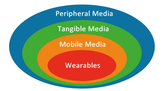
Figure 1. Shell model of ubiquitous media used in ALS. (Own work)